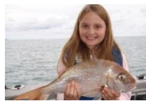
Snapper heaviest on (light line)